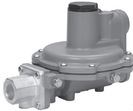
Figure 1. Type R632 Integral Two-Stage Regulator

The Type R632 is an Underwriters Laboratories listed regulator designed for Two-Stage LP-Gas systems. The unit is designed to reduce the tank pressure through an integral two-stage system to 11-inches w.c. (27,4 mbar). The first-stage screened drip-lip vent is oriented downward and the second-stage vent is oriented over the outlet as standard.