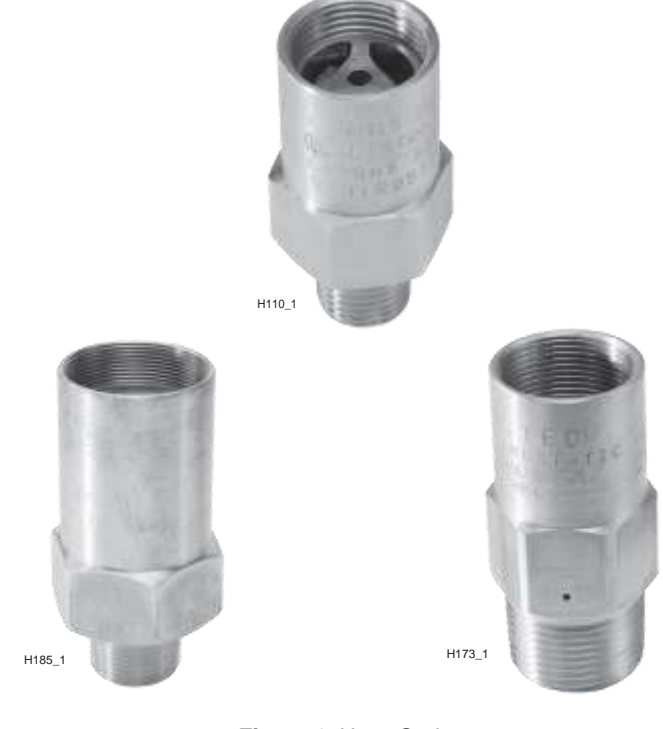
Figure 1. H100 Series

1. The purpose of a relief valve is to keep the tank from rupturing from excessive tank pressure by venting gas to the atmosphere until the tank pressure