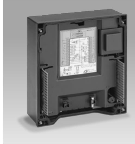
Burner control unit BCU 370.