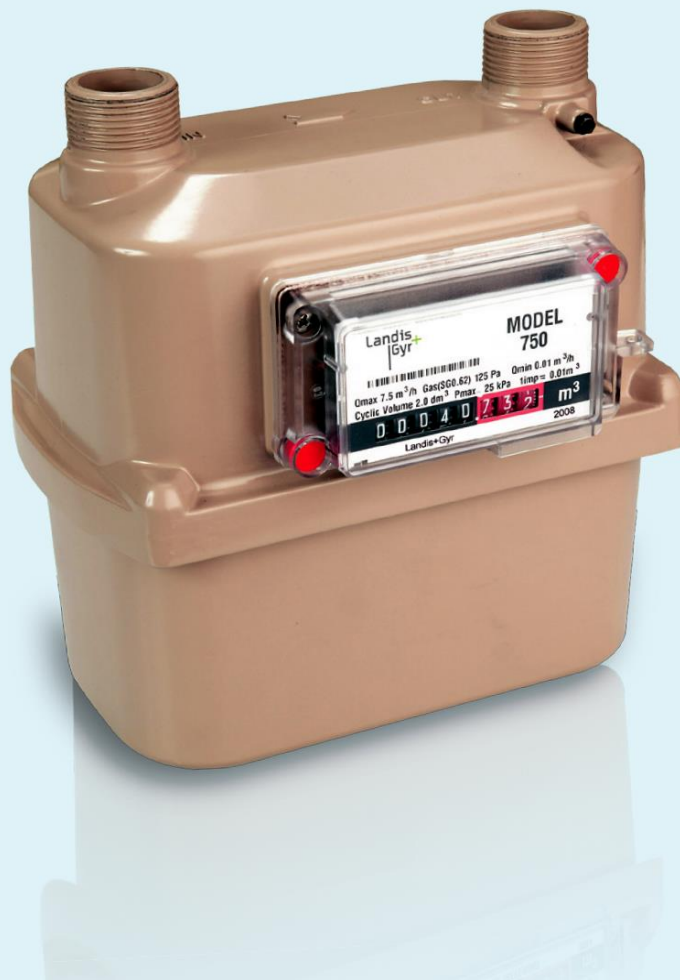
Model 750 High Capacity Gas Meter