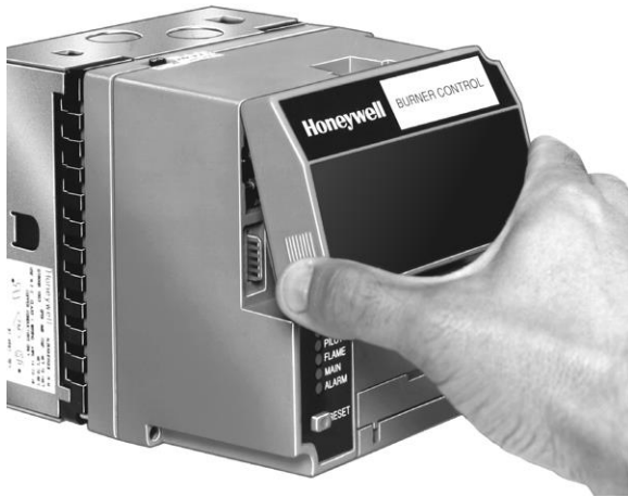
Fig. 2. Mounting Remote Reset Module.

The S7820A Remote Reset Module mounts directly on the Relay Module.