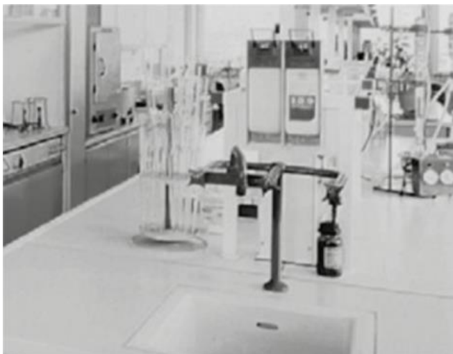
Pressure switch for fan monitoring in laboratories.

For instance for safeguarding an air flow rate and for monitoring filters and fans.