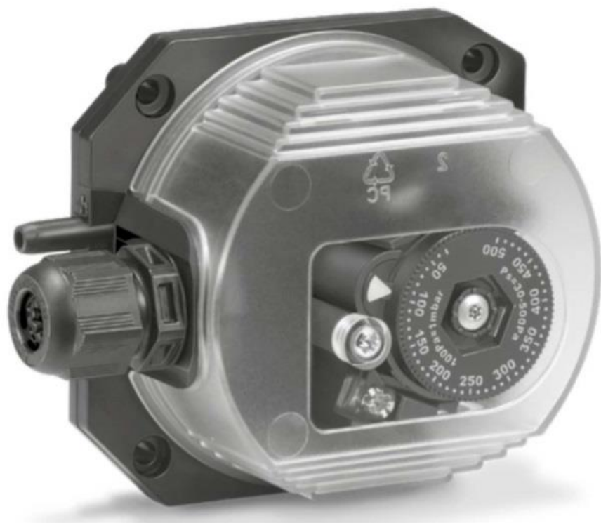
CPS 330 – 4000